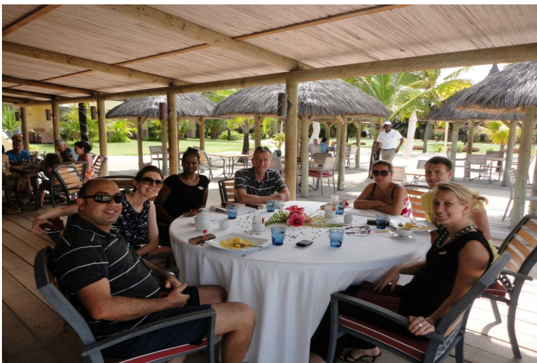
Lunch at Preskil at the Tapas restaurant