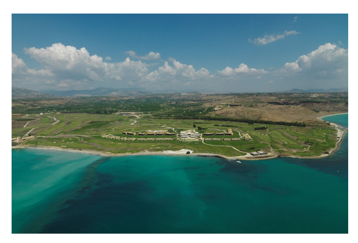
"The Vedura resort is set over 230 hectares of stunning landscape with 18km of private coastline yet has just 203 rooms and suites giving a discrete exclusivity that few places in Europe can match"

This perfect sounding description are not my words but those of the Vedura Golf and Spa Resort publicity brochure and I believe after a recent resort inspection that my role as your travel agent is to either support or refute these claims. As this will be my second Italian beach location this year, I feel perfectly equipped to do so.